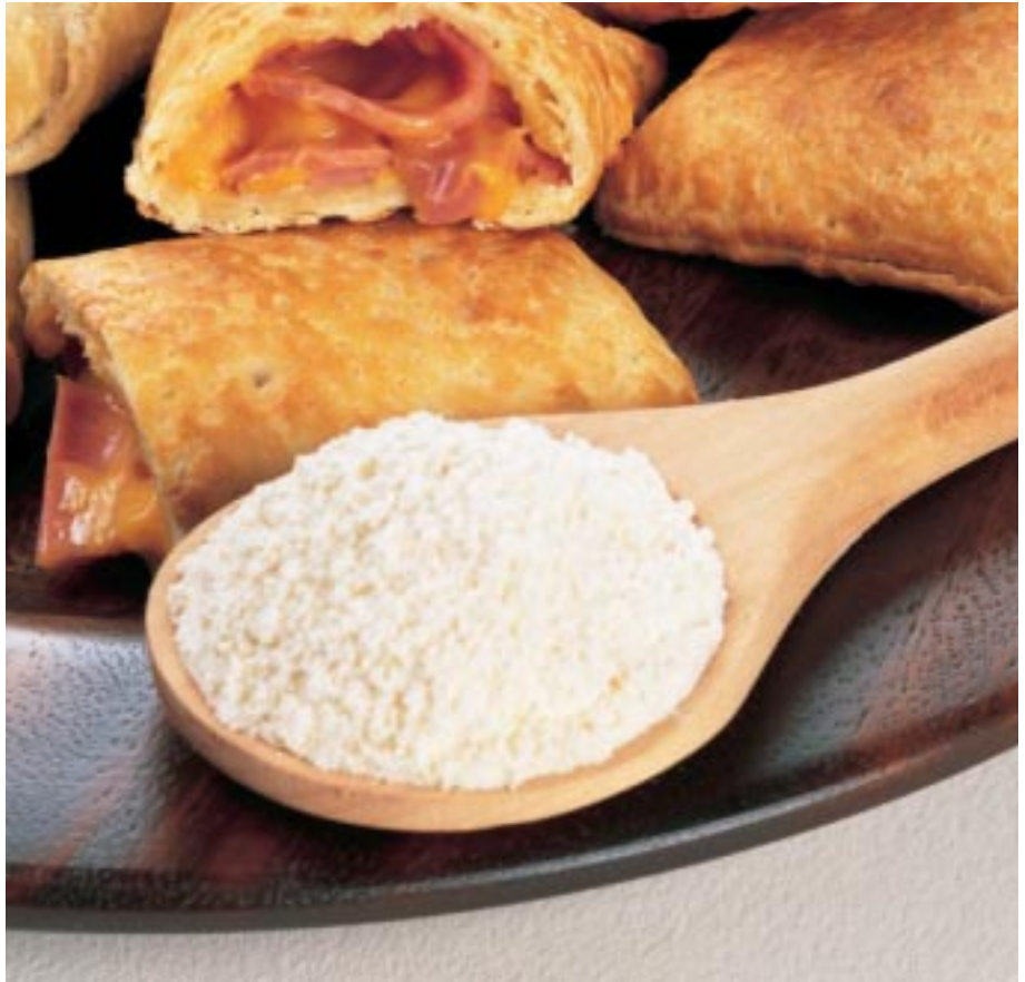
Essential Amino Acid Content of Selected Proteins (mg/g of protein)

Whey proteins are quickly absorbed in the body to provide an abundant supply of essential amino acids to organs and tissues, and they stimulate muscle regenerative mechanisms. 23 Consuming 20 or 30 grams of WPI and WPC together with carbohydrates before and after exercise training may be an ideal strategy to help minimize exercise-induced immune suppression as well as enhance muscle recovery. By virtue of its excellent amino acid profile, absorption kinetics and immuno-enhancing capabilities, whey protein is a highly nutritious ingredient that may benefit a variety of populations. Although clear guidelines regarding a daily dosage of whey protein are yet to be established, research has shown benefits with dosages within the vicinity of 20 grams/day, up to 1.5 grams per kilogram of body weight per day.