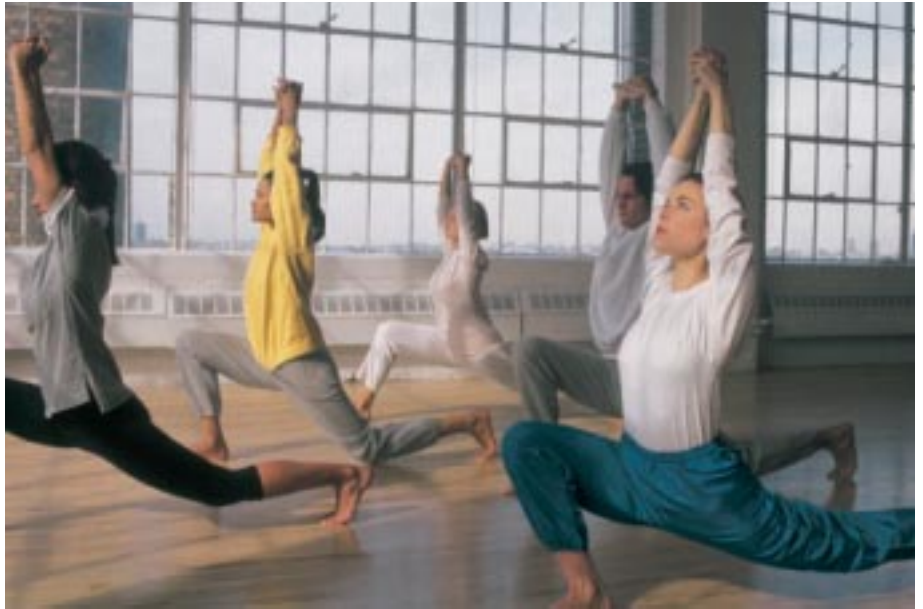
Studies have shown that whey proteins can improve glutathione status. Glutathione is the essential fuel that powers immune function.

Many active people do not realize that their muscles and their immune system are intimately connected. The amino acid glutamine is the essential fuel that powers immune function and it is synthesized predominately within muscle tissue. 53 This amino acid cannot be manufactured by immune cells and must be provided by muscle. 61 The immune system requires large amounts of glutamine on a continuous basis. Problems arise if metabolic demands exceed synthesis rates. When lifestyle factors that create stress (such as inadequate nutrition and lack of sleep) are combined with intense exercise training, the body's demand for glutamine can easily exceed synthesis capabilities. 53 At the very least, this can result in a reduction in athletic performance. But more serious repercussions are reoccurring infections and persistent illnesses such as chronic fatigue syndrome. 50,53